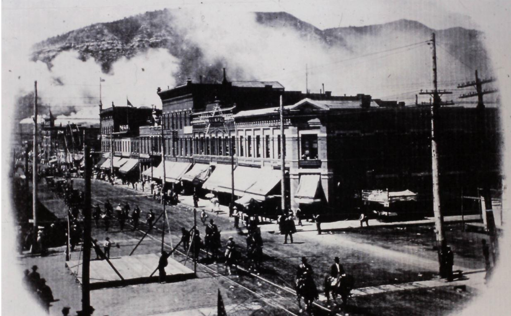
(Main Avenue Durango circa 1903)

Thus ends this synthesis of the record of the early Durango City Council minutes regarding how the City responded to outbreaks of contagious disease. The obvious question now is, how did these previous epidemics—and the response to them—compare with the recent COVID-19 situation?