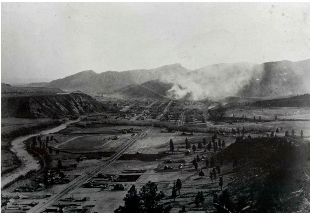
(above: aerial view of Durango ca. Nov. 1910)

In the Search Type, select Search Type = Histories-INDEXED SEARCH and enter *diseases* [with the asterisks] in the Subject box to retrieve the e-Book.